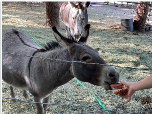
Food Recovery Hierarchy